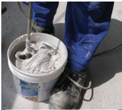
Preparing the mix