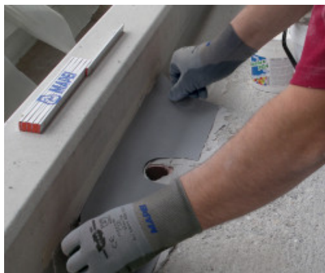
Laying flexible hyphalon brace