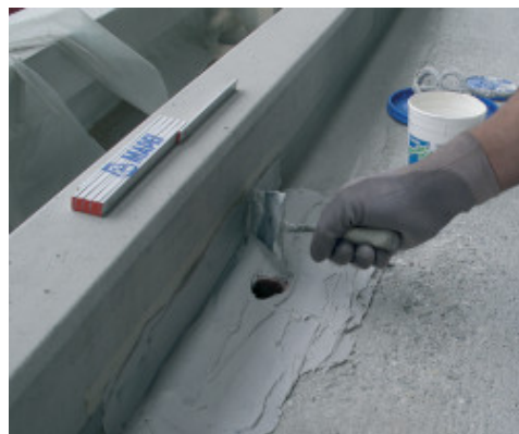
Final covering with Adesilex PG4