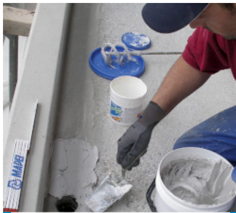
Applying Adesilex PG4 with a trowel