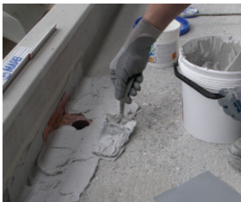
Subsequent smoothing with Adesilex PG4