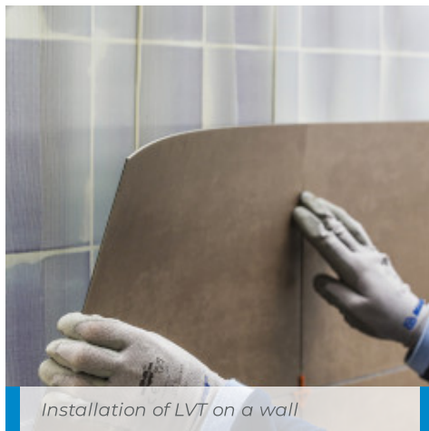
Installation of LVT on a wall