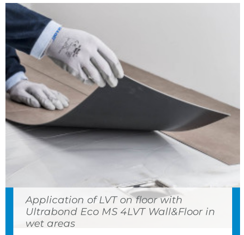
Application of LVT on floor with Ultrabond Eco MS 4LVT Wall&Floor in wet areas